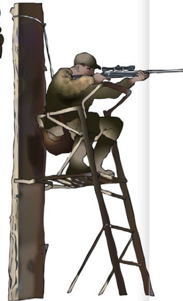
(above) tree-supported and (below) freestanding