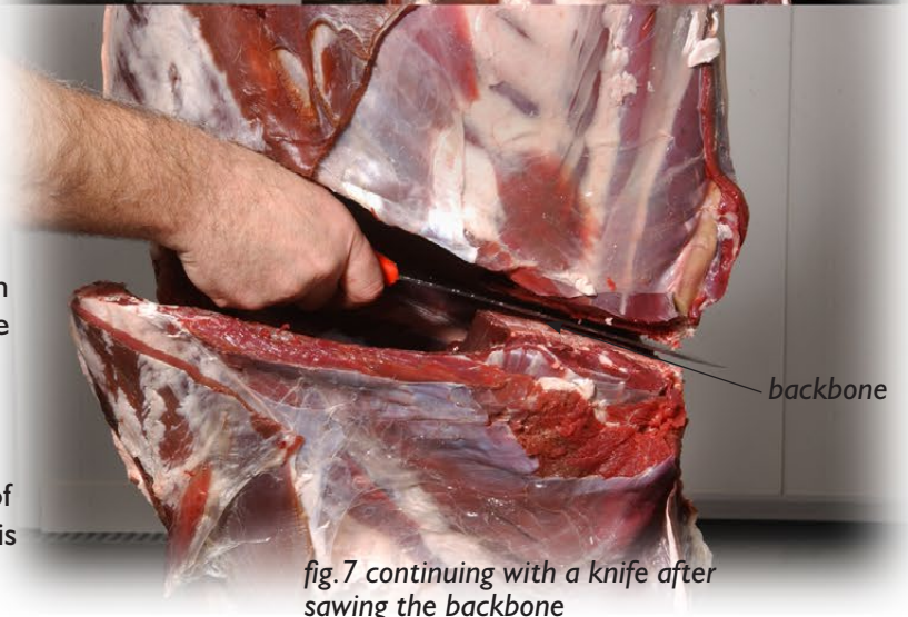
fig.7 continuing with a knife after sawing the backbone