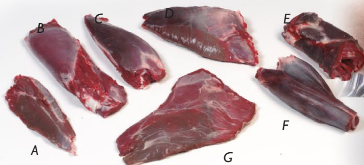
fig.4 shoulder block muscle group: A: inner blade – diced; B: feather – diced and casserole; C: blade – diced and casserole; D: thick rib of LMC – braising steaks; E: clod – mince; F: fore shin – shin and mince; G: flat blade – diced and mince