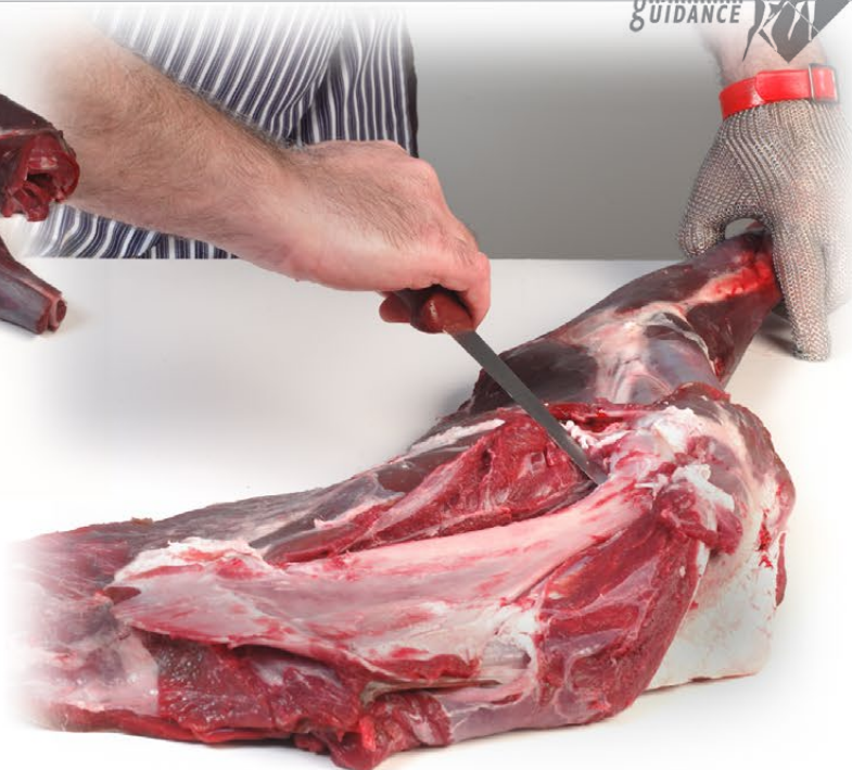
(fig.5 above) boning out the shoulder