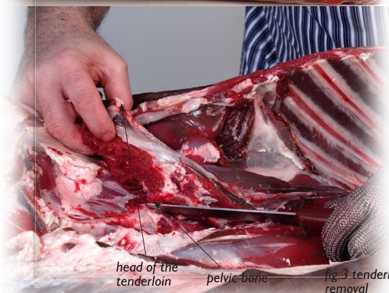
fig.3 tenderloin removal