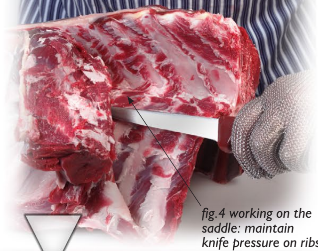
fig.4 working on the saddle: maintain knife pressure on ribs

3 The saddle is prepared using a sheet boning method to remove the striploins from each side of the vertebrae. Care must be taken to ensure that the knife is always pressed onto the ribs (fig.4).