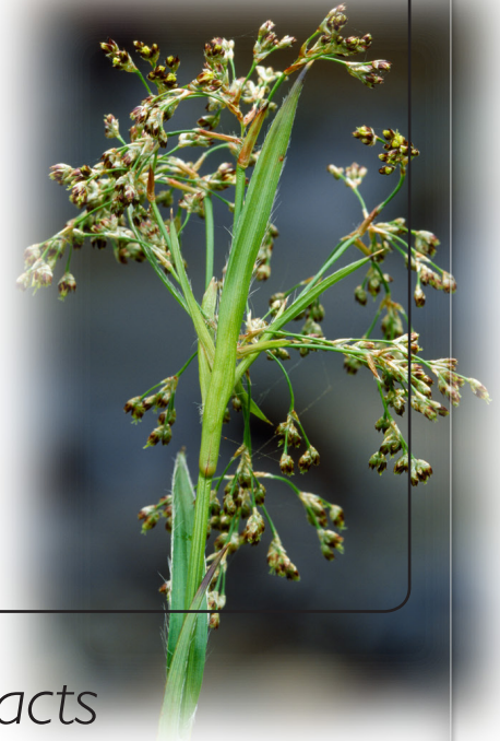
(left) signs of high impact: no flowering woodrush (and/or key species) present (right) signs of low impact: flowering woodrush and/or flowering key species

Where soils are acidic, lush mixtures of dwarf-shrubs, ferns (other than bracken) and greater woodrush are typically present.